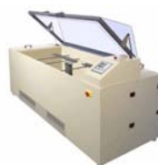
Horizontal Salt spray chambers.