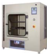
Vertical Salt spray chambers.