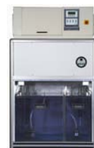
SOLARBOX R.H. with Humidity Control

We reserve the right to make changes to equipment and systems in response to advances in technology and modify parameter values accordingly.